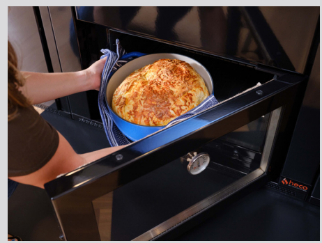
Glass Oven Door Added style for your HECO. Allows for a great view of your food.